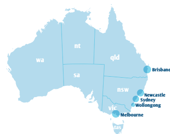
Competitor One East coast major cities