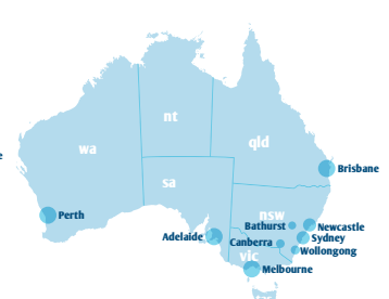
Competitor Two East coast major cities, Adelaide & Perth